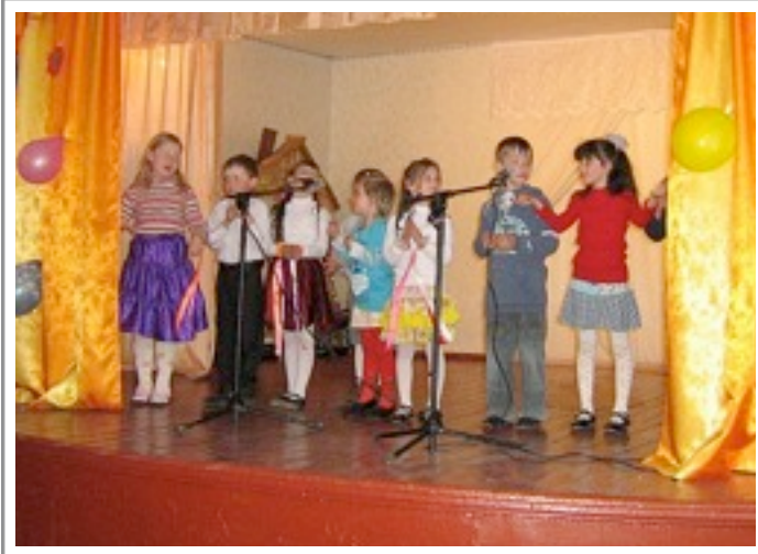
The Children Doing a Skit

Children of parents who have recently repented became the focus of the children of our church in Nosovka. They took it upon themselves to prepare a few skits and invite children and their parents to a special meeting. “We need to reach out to these kids” they told the pastor. “We can do it too. We will plan everything.” Well, they did need some help but their parents stepped in to make it happen. The result was that many more were added to the Kingdom!