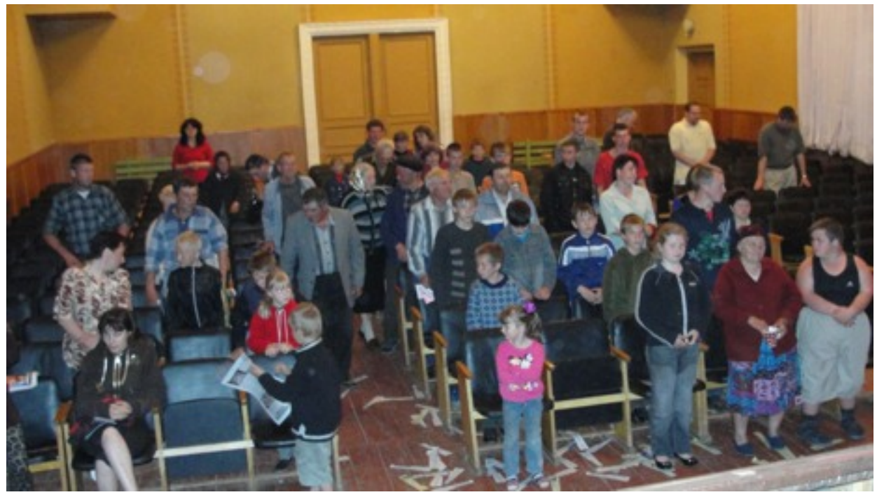
Except for a few in the room most people stood to their feet in an act of faith as they repented and pledged to follow Christ.