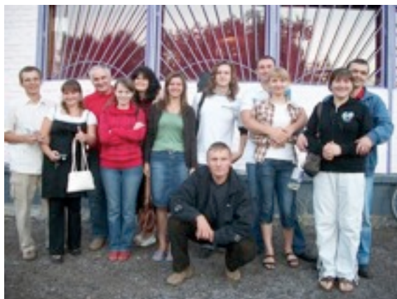
The Ministry Team That Invaded Zhavinka

The team not only held the crusade but ministered on the streets leading more people to the Lord and praying for many.