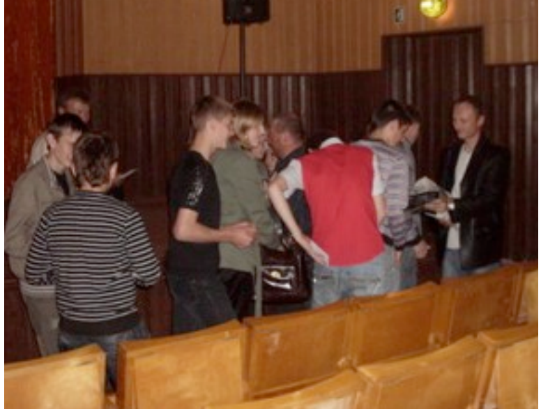
Ten youth repent and open hearts to the Lord!