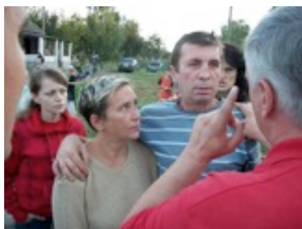
Valera casts out demon