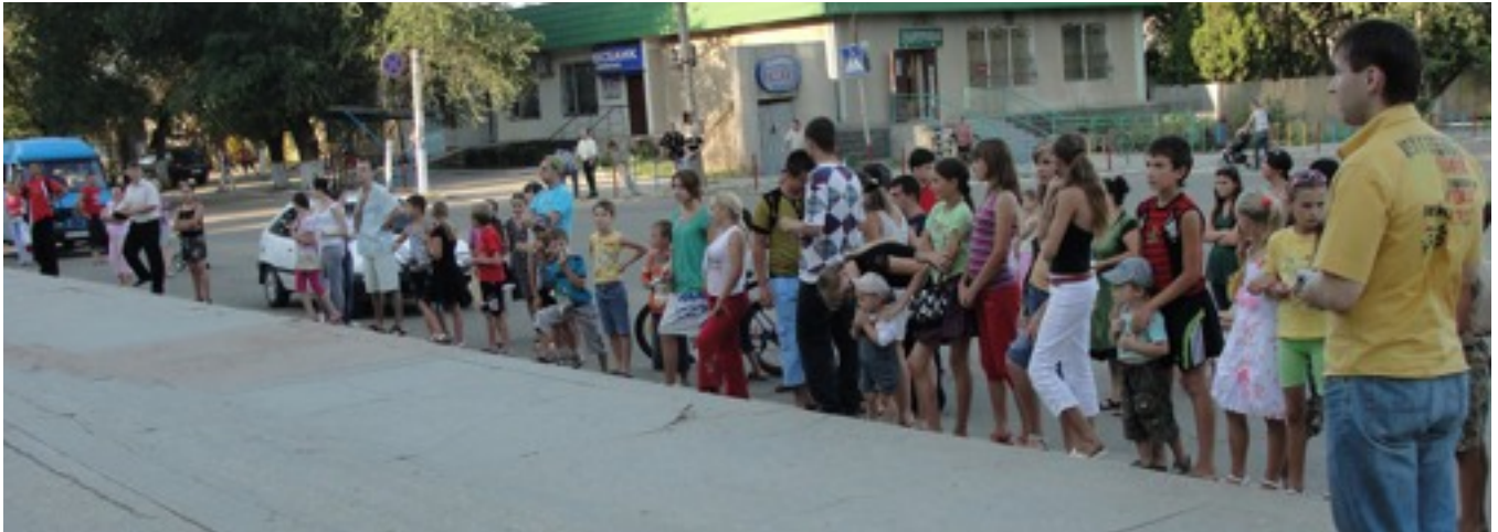
Second nights altar call drew many more to dedicate their lives to Jesus!